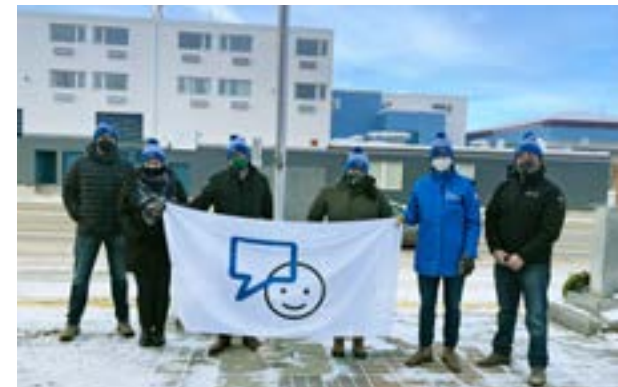
Premier Silver joins community leaders at Whitehorse City Hall to raise a flag in recognition of mental health and Bell Let's Talk Day 2022.

“The Yukon continues to experience strong economic growth despite the impacts of the pandemic. The territory has the lowest unemployment rate in the country.”