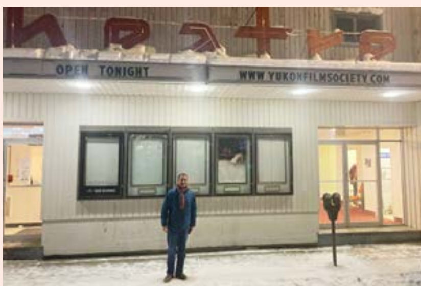
Minister of Economic Development Ranj Pillai stops by the Yukon Theatre on its reopening night in December 2021.

The Yukon government also created four new film, television and digital media funding programs to support local media content creators. Funding is available for projects at every stage of development. The Yukon is home to exceptionally talented and unique film and digital creators. These new programs will support this growing sector and help Yukon creators bring their ideas to the screen.